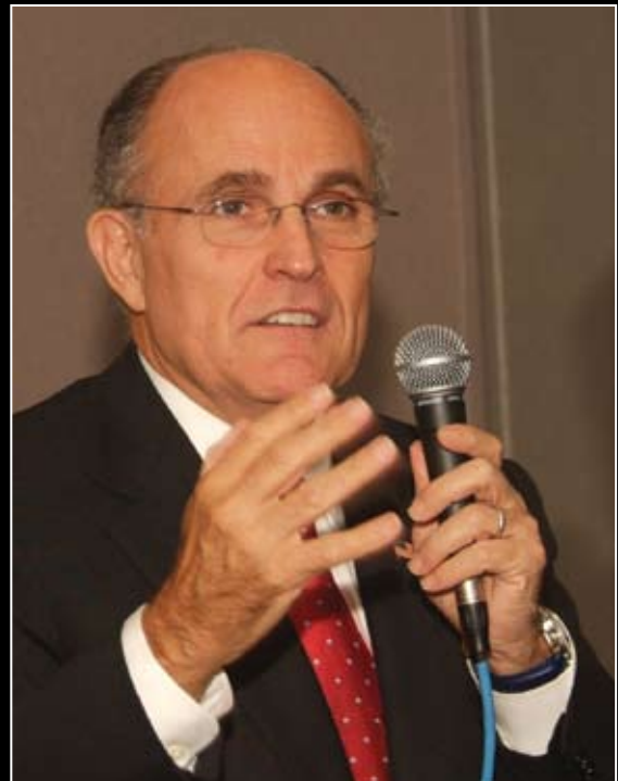
Rudy Giuliani raises issues on the use and abuse of pain medications