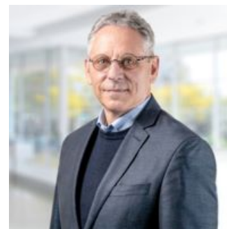
Vision to Action Award