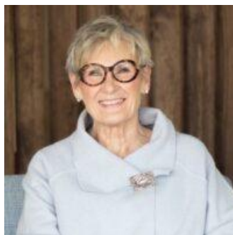
Vision to Action Award